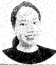
Program Director of Consuelo Foundation

"On and Online - Taking Lead in Ensuring Child Safety"