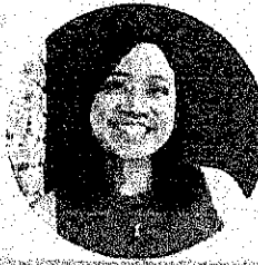
Program Officer of Consuelo Foundation