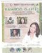
Stories - Attachment.jpg 248K

This online discussion is organized in partnership between the Office of Deputy Speaker Legarda and the Climate Change Commission, with support from the Department of Education, Philippine Information Agency, Institute for Climate and Sustainable Cities, The Climate Reality Project-Philippines and Mother Earth Foundation. ###