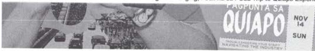
Poster by Nicole Duldulao